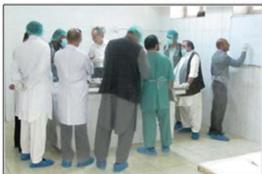
Participants examining a body (latex) as part of the course exercises of the 11th National Course on the Management of the Dead, Pakistan Participants discussing a forensic case during the 1st Forensic Medicine Workshop, Afghanistan